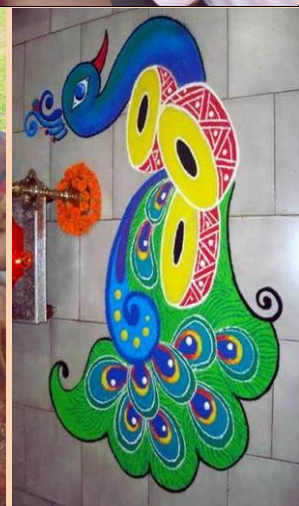
Activities for the day